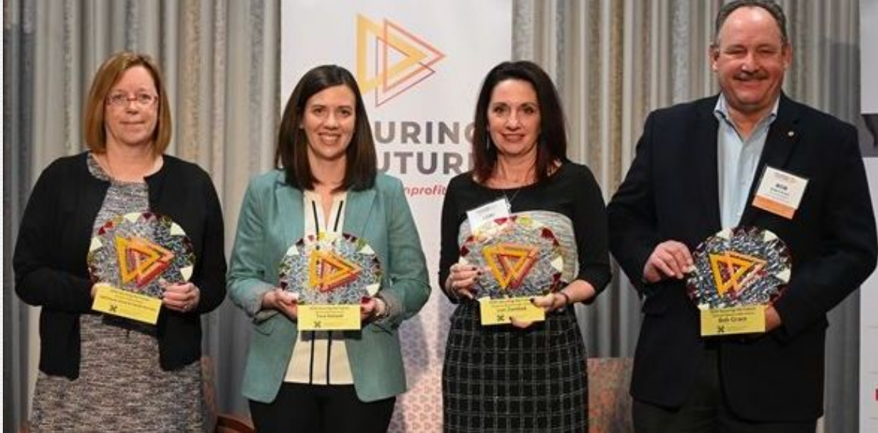
Congratulations to our inaugural honorees!